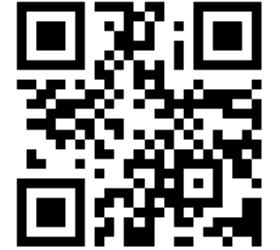
Total Rewards Guide